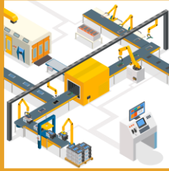
Track 1 Materials and Manufacturing Processes