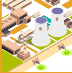
Track 2 Thermal and Fluid Engineering