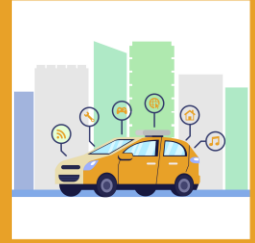
Track 4 Automotive and Aerospace Engineering