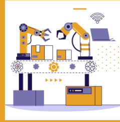
Track 3 Design, Dynamics and Control Systems